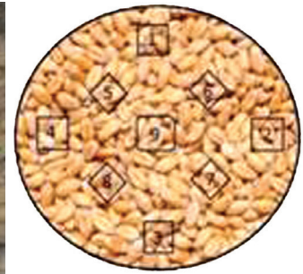
Fig. 3. Sample collection from subsamples

Food Corporation of India is the single largest agency which store food grains in the warehouses.